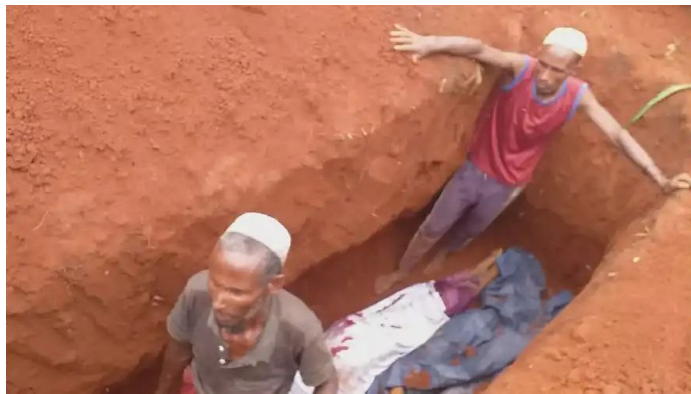
(b) Photograph of residents burying victims in a mass grave.