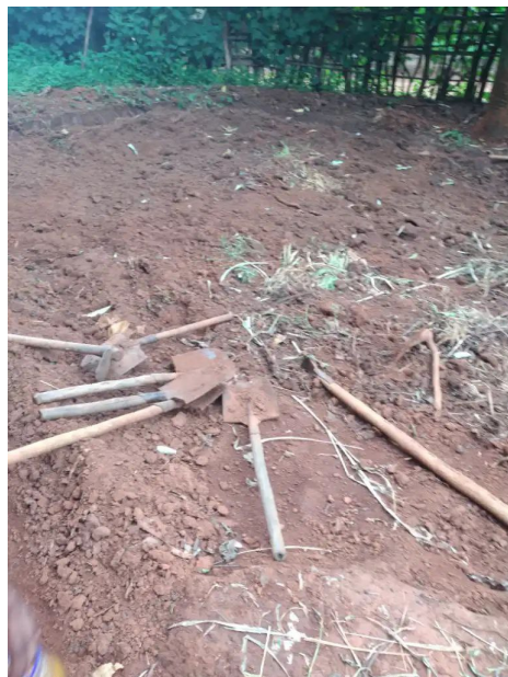
(c) A mass grave site located on the property of Jafar Mosque containing 63 bodies.