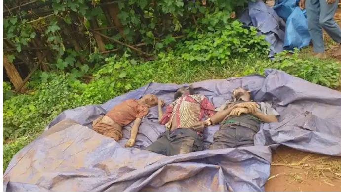
(a) Photograph of bodies belonging to members of a single family who were killed in the massacre. Names of the victims were as follows: Seyd Dawid (aged 11) (left), Sheikh Dawid Indris (middle), Mohammed Dawid (right).