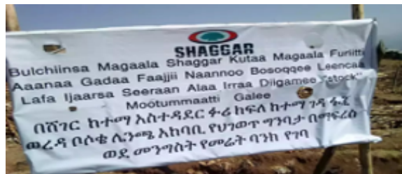
Figure 1: This post shows land taken from Amhara owner to the city administration in the house demolition campaign.

According to AAA’s sources, Lencho Sefer was previously administered by under Woreda 03 of Kolfe-Keranio sub-city of Addis Ababa city. However, without the consent of the local residents, the Oromo expansionist government unilaterally decided to incorporate the newly established Sheger city under the Oromia Regional State. Under the new administration, the area is under the Geda-Ficha Woreda of the Furi sub-city in Sheger city. Taking advantage of this annexation, the newly established Sheger city established a task force for the demolition of homes belonging to non-Oromo residents and especially ethnic Amharas. On January 11th, 2023, the task force started demolition of homes in the early morning. In the following days, the task force with the help of the OSF, the Oromia police and local Qeerro demolished at least 1,300 homes most of them belonging to ethnic Amharas and Silte residents. Following this, at least 3,000 innocent civilians have become homeless and displaced from their home. This forced them to live under dire situation without even fulfilling their basic needs hence they are forced to live in the field.